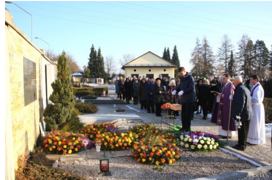
At the Graveside